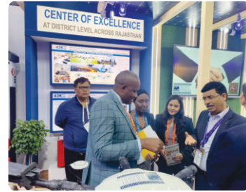
Hon'ble Amb Margaret Kyogire, Deputy High Commissioner of Uganda