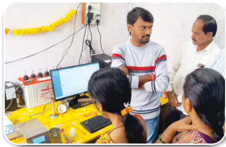
Milk collection at a Women Milk Society Karimnagar

Apart from this, regular orders for 164 Electronic Milk Tester from Central, Northern, Gujarat, Rajasthan, Southern & UP Region, 750 Milk Analyzer from Central, Northern, Gujarat, Rajasthan & Southern Region, 10 nos. of BMC data Logger from Northern Region & 01 nos. of Somatic Cell Counter from UP Region have been received during the quarter.