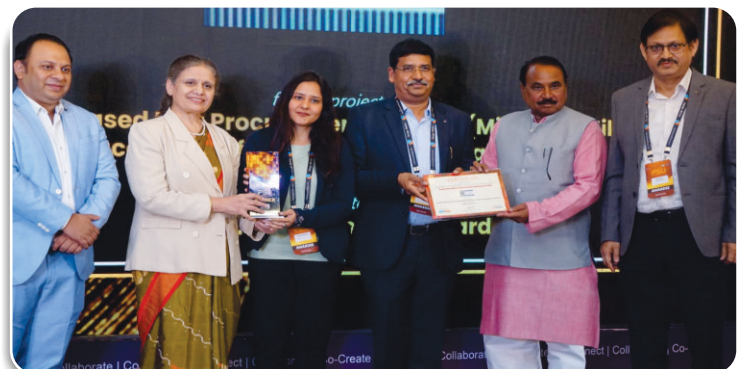
Award to Company under the Category "Digital Transformation" for the Project "Cloud Based Milk Procurement Solution (MilkNet & Milk Producers App) for Digitalization in Dairy Sector