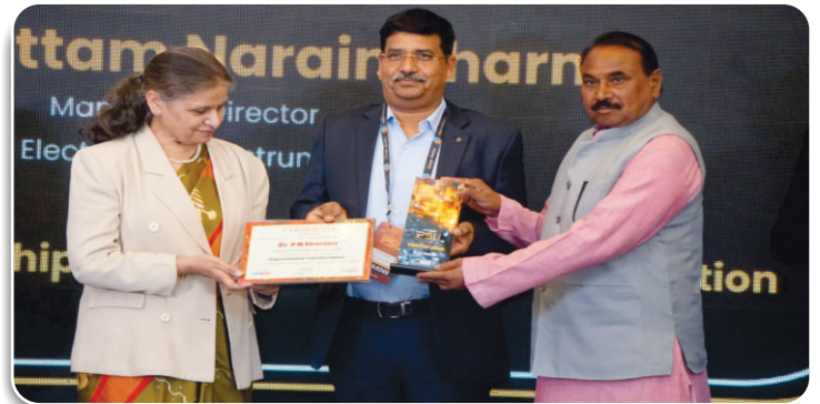
Outstanding Leadership in Transformation Award for Drone Project to MD REIL

The another award was presented under the Category "Digital Transformation" for the Project "Cloud Based Milk Procurement Solution (MilkNet & Milk Producers App) for Digitalization in Dairy Sector” by the esteemed dignitaries to MD REIL and Team during the occasion.