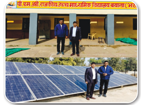
MD REIL at PM Shri School

an order executed by REIL for Off grid & on grid solar systems at 291 nos. Govt. PM Shri schools in Rajasthan. The School administration appreciated the work done by REIL and quality of products and REIL services provided.