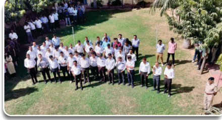
शपथ ग्रहण समारोह

वल्लभभाई पटेल की जयंती 31 अक्टूबर 2024 को 'राष्ट्रीय एकता दिवस' के रूप में मनाया गया। इस अवसर पर सभी अधिकारीगण/कर्मचारीगण को सतर्कता जागरूकता सप्ताह के उपलक्ष्य में आयोजित शपथ राजभाषा हिन्दी में दिलवाई गई। शपथ ग्रहण समारोह के पश्चात एकता दौड़ का आयोजन किया गया। जिसमें कम्पनी कर्मचारियों द्वारा भाग लिया गया।