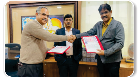
MoU between REIL and Garuda Aerospace Pvt. Ltd., Chennai

MD REIL at Jaipur, to forge a collaborative partnership focused on advancing education and training in drone technology. The agreement outlines the development of cutting-edge infrastructure, including a state-of-the-art Remote Pilot Training Organization (RPTO) center at REIL, Jaipur premises, which will provide hands-on industry exposure to trainees.