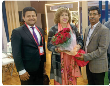
Capaya Rodriguez, Hon'ble Ambassador of Vanezuela