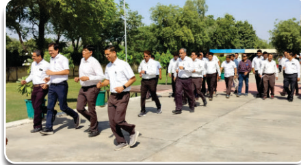
एकता दौड़ का आयोजन